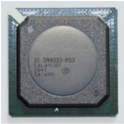
Emulex Pilot 3 single-chip multi-function iBMC

COST-EFFECTIVE, HIGH-PERFORMANCE REMOTE MANAGEMENT CONTROLLER